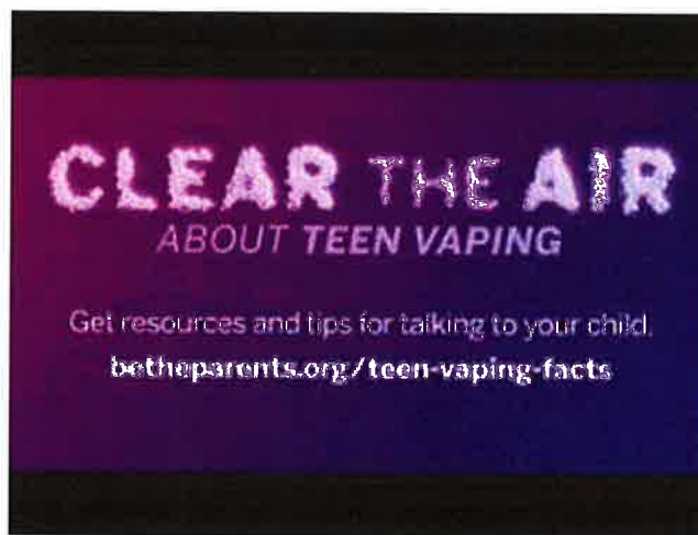
:15 “What’s in a Vape?”