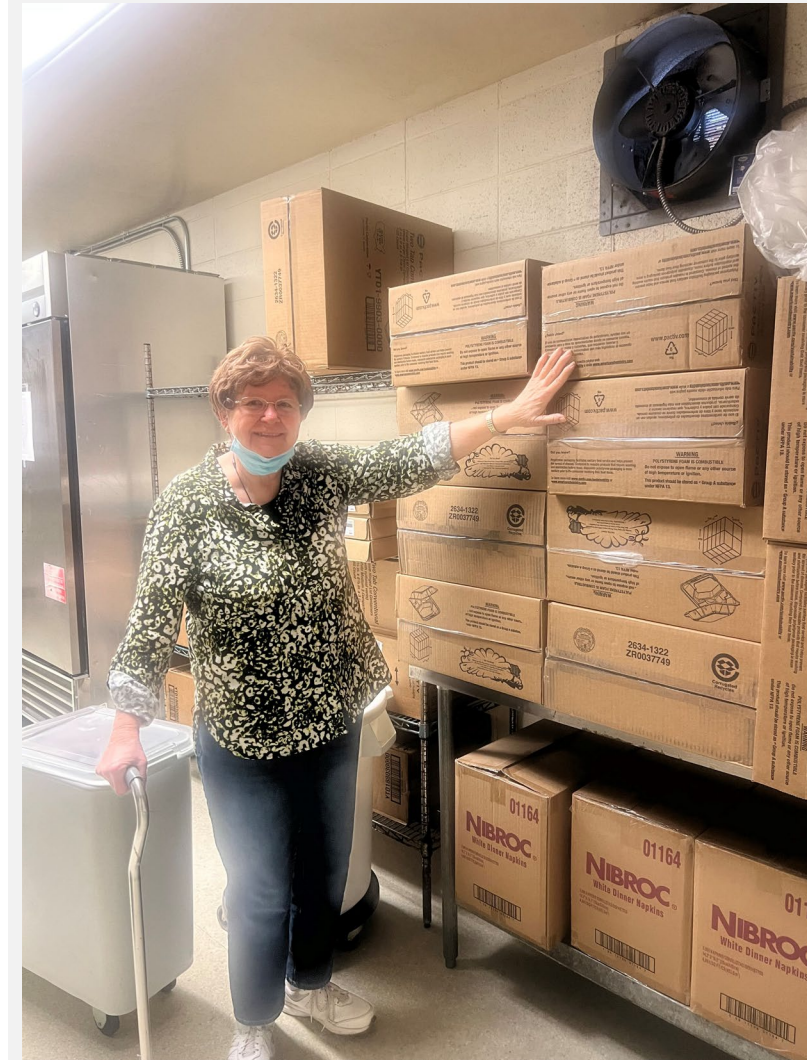
Greater Pocatello Senior Activity Center