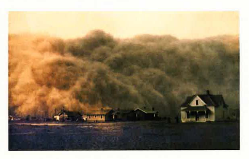
Stratford, Texas, 1935

During President Roosevelt's first 100 days in office in 1933, several government programs were set forth to conserve soil and restore ecological balance.