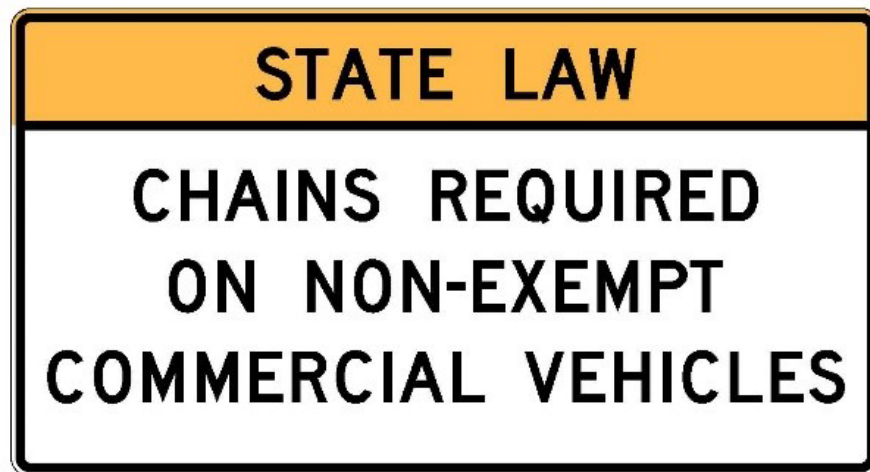
Figure 2B-34. Chains Required On Non-Exempt Commercial Vehicles Sign

10. Figure 2B-34. Chains Required on Non-Exempt Commercial Vehicles Sign. On page 102, add the following figure: