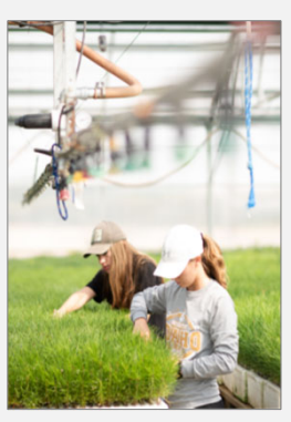
Policy Analysis Group