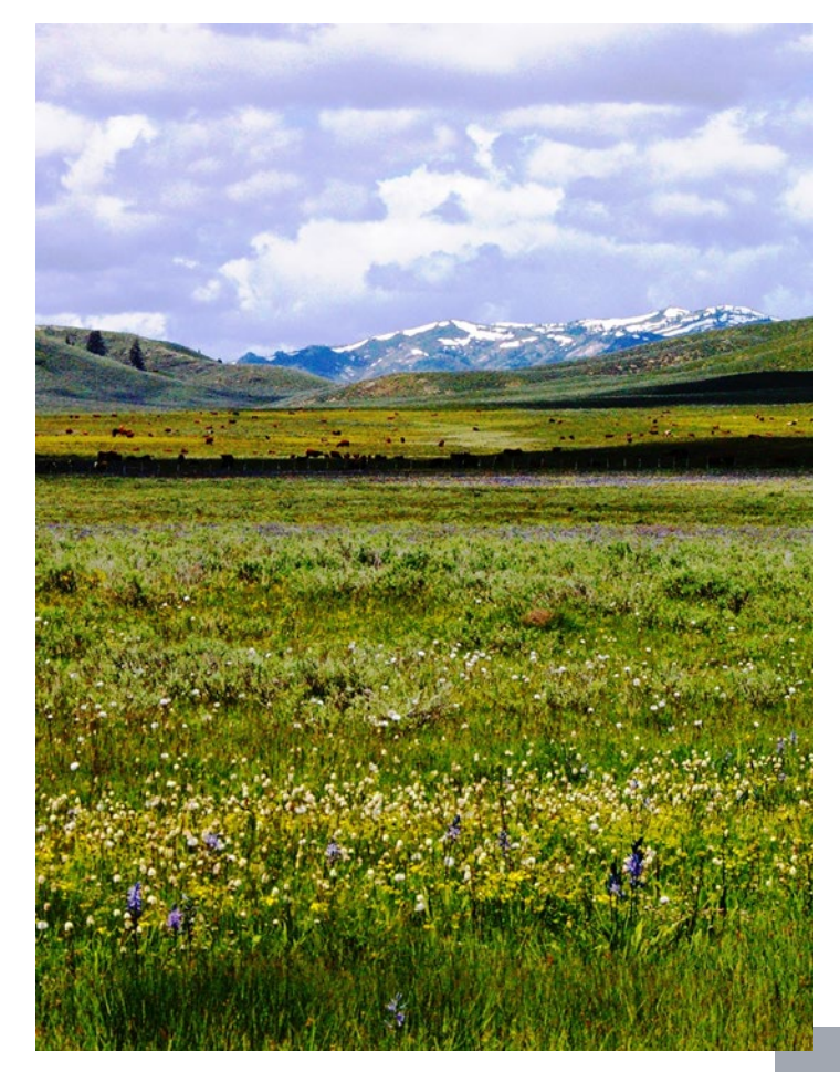
Idaho Department of Environmental Quality