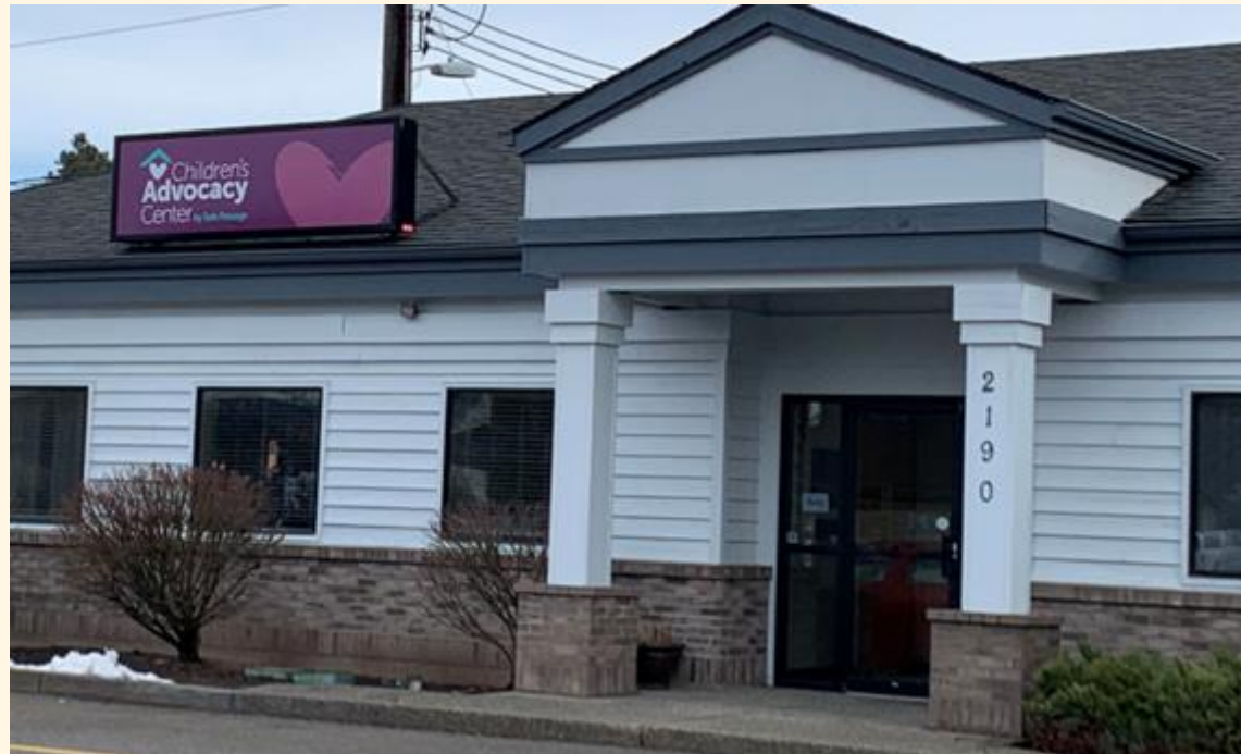
Safe Passage CAC