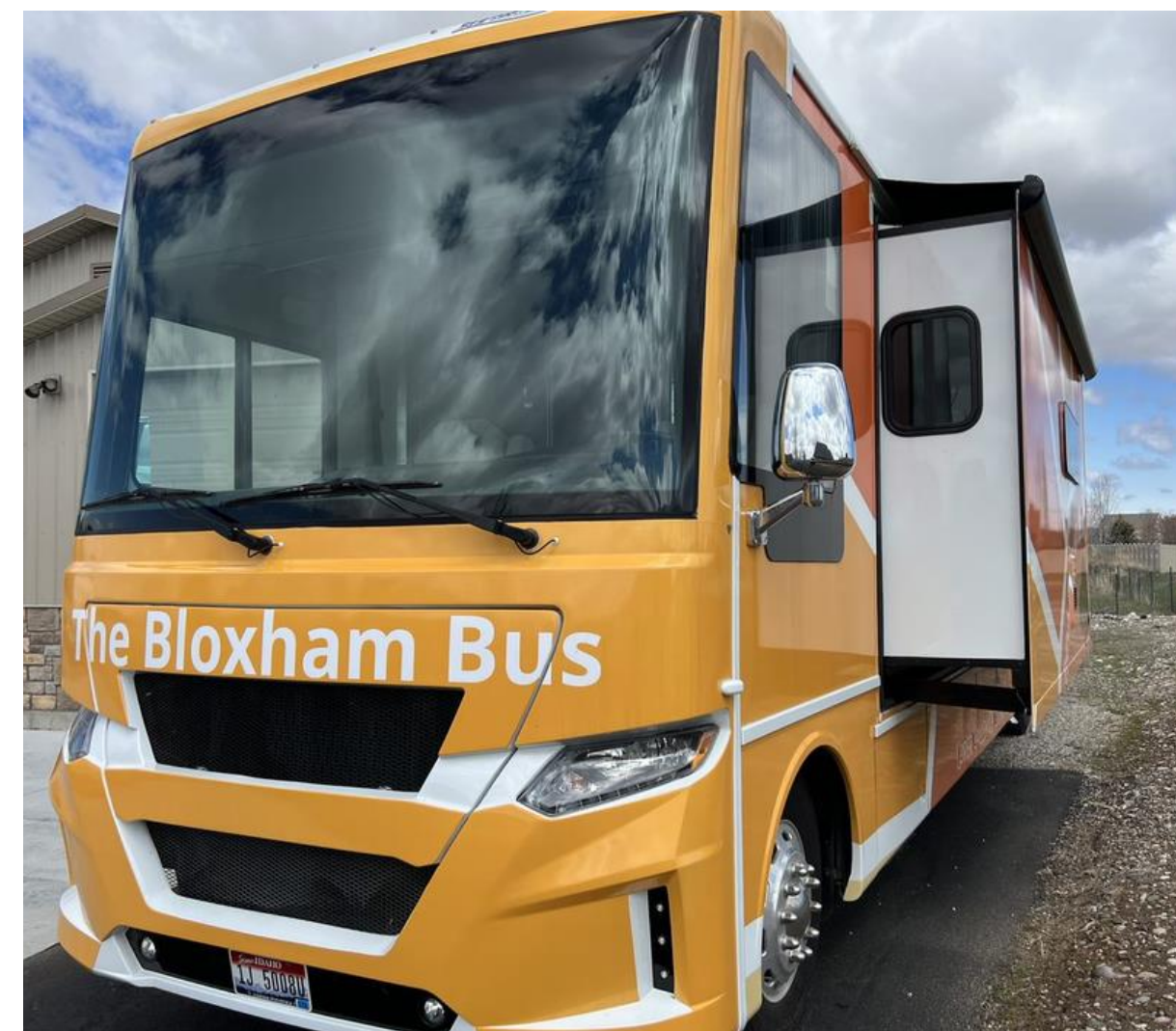
Mobile CAC - Upper Valley CAC - Rigby

Mobile CACs bring the services to the rural communities of Idaho to serve the counties and MDTs that don't have dedicated resources to the child forensic interview and collaborative investigation processes.