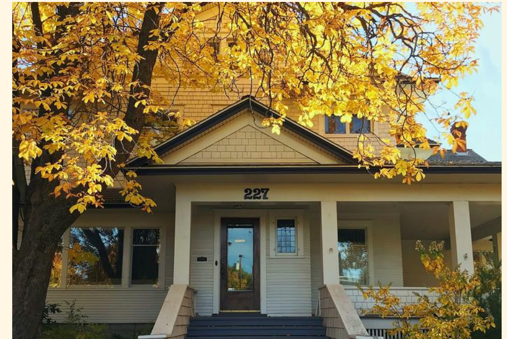
LillyBrooke Family Justice Center