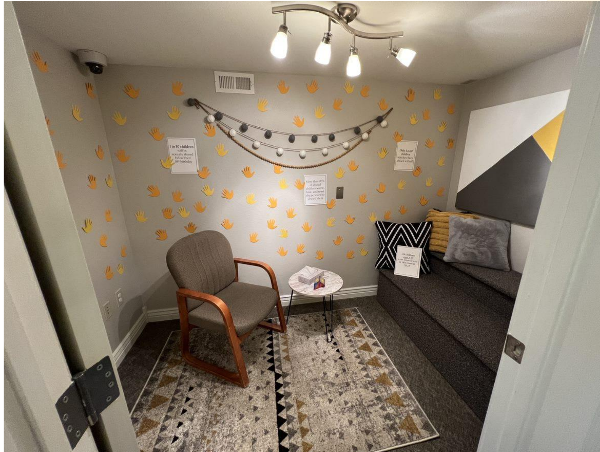
Child Forensic Interview Room at Bright Tomorrows CAC - Pocatello