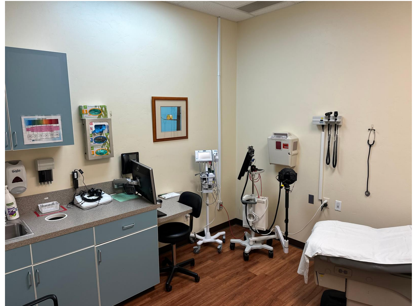
Medical Room - St Luke CARES Magic Valley, Idaho Falls