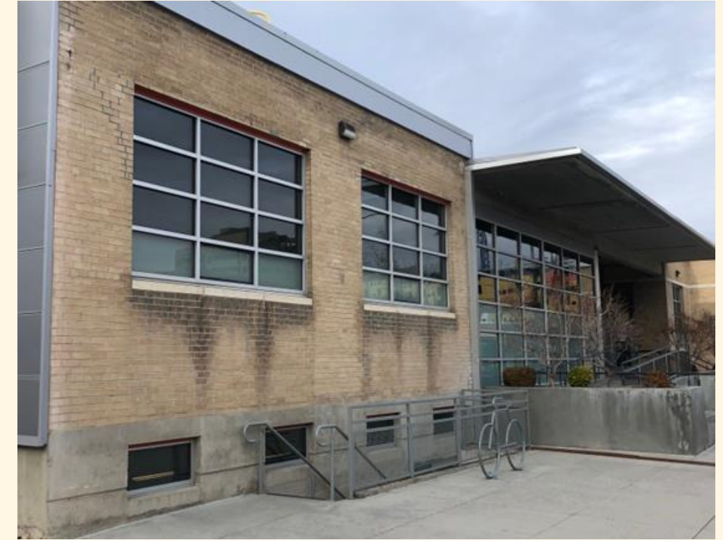
St Lukes CARES Boise