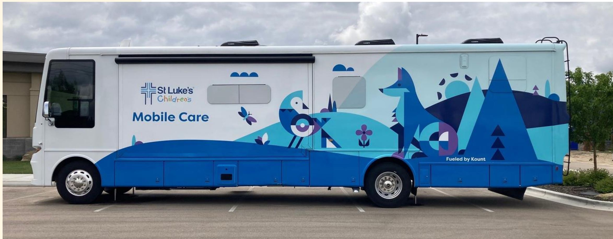
Mobile CAC - St Lukes CARES - Boise

Mobile CACs bring the services to the rural communities of Idaho to serve the counties and MDTs that don't have dedicated resources to the child forensic interview and collaborative investigation processes.