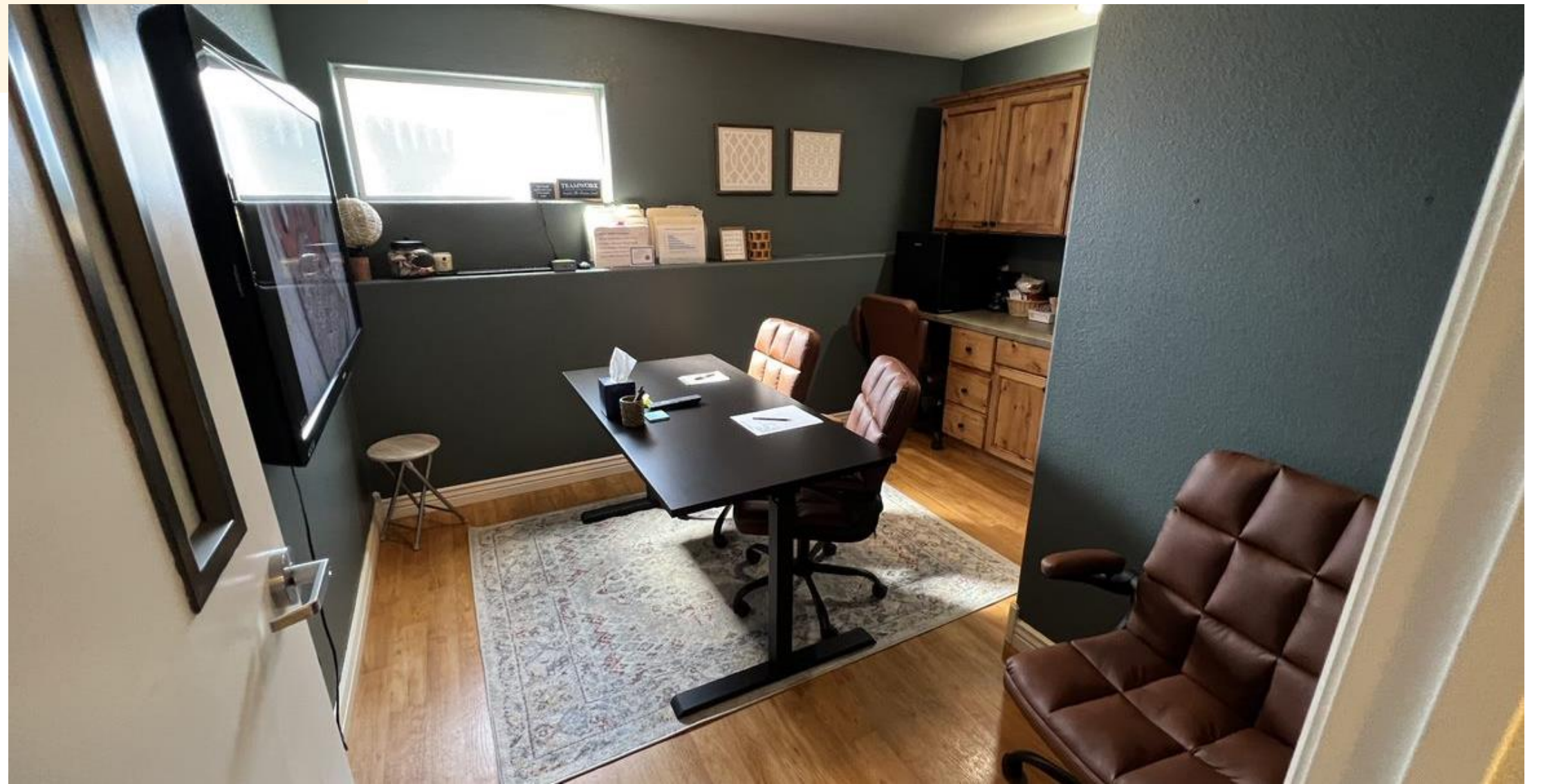
MDT Observation Room - Bright Tomorrows CAC, Pocatello