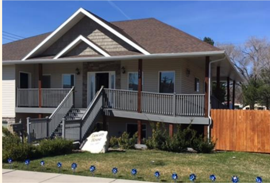
Bright Tomorrows CAC

Each Idaho CAC has its own personality, but all are driven by a passionate mission to help the children of Idaho