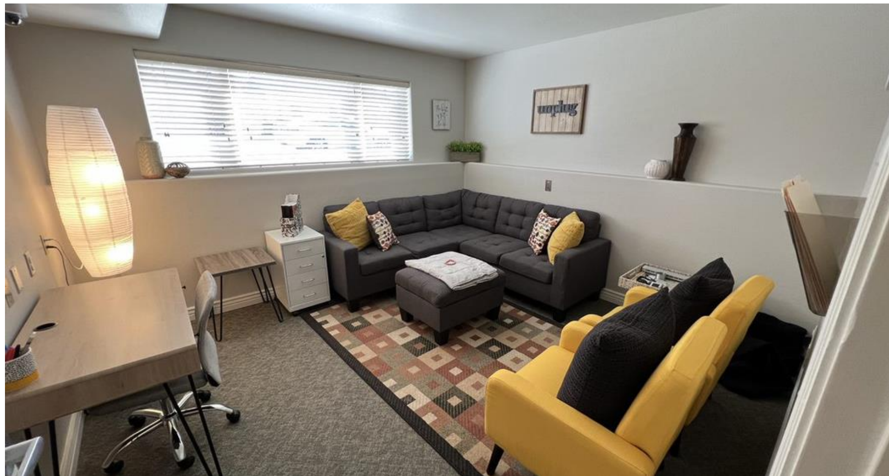
Family Counseling Room - Bright Tomorrows CAC, Pocatello